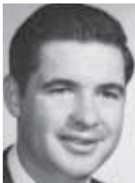
Dan Devine 1955-1957