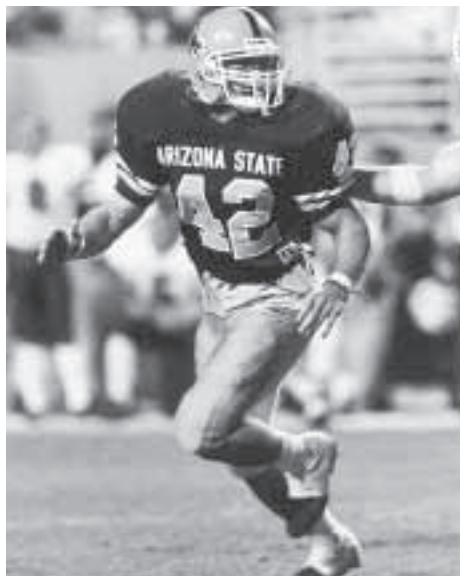
The 1997 Pac-10 Defensive Player of the Year, Pat Tillman was also a two-time Academic All-American.