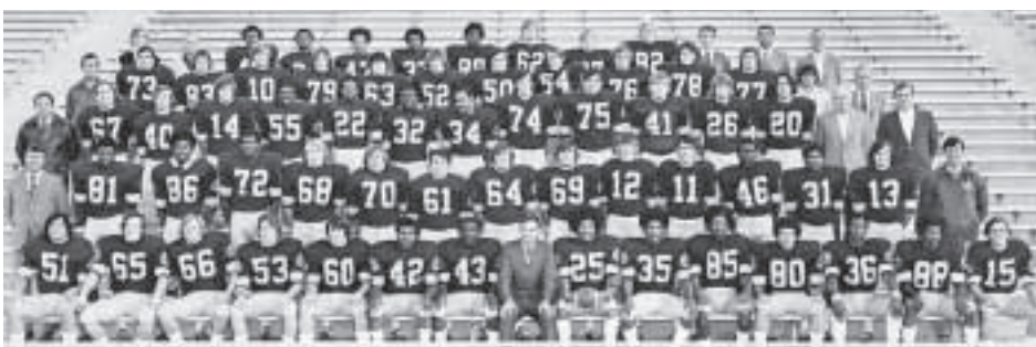
1972 Arizona State Fiesta Bowl Team