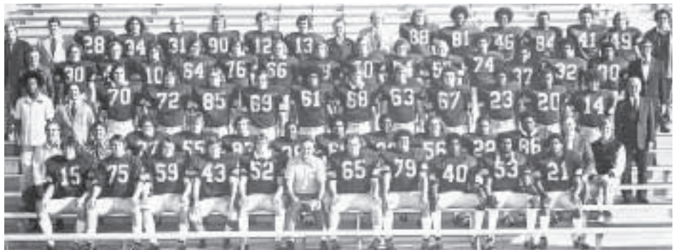
1975 Arizona State Fiesta Bowl Team