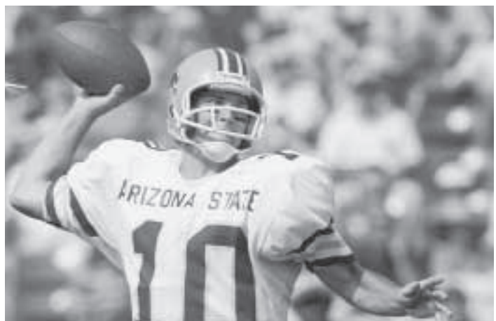
Quarterback Mike Pagel, who led ASU in total offense in 1980 (2,003 yards) and 1981 (2,484), enjoyed a productive NFL career.