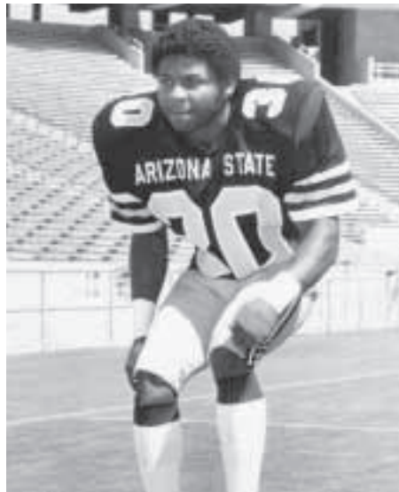
Ron Brown, who doubled as a cornerback and wide receiver at Arizona State, also won a gold medal for the United States in the 4 x 100-meter relay in the 1984 Olympics in Los Angeles.

W 32 Phoenix Indians Alumni (h) 0 W 72 Northern Arizona (a) 3 L 7 Phoenix Indians (h) 19