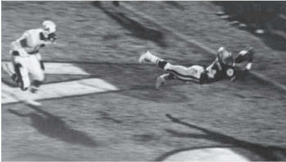
Wide receiver John Jefferson made "The Catch" just before halftime of the 1975 Arizona-Arizona State game. ASU won, 24-21, preserving a perfect 12-0 season.