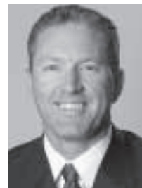
Dirk Koetter 2001-present