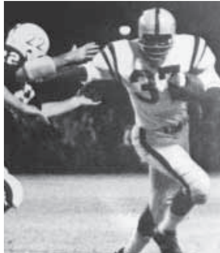
Charley Taylor, one of three former Sun Devil football players enshrined in the NFL Hall of Fame in Canton, Ohio, earned All-Western Athletic Conference honors in 1962 and 1963.