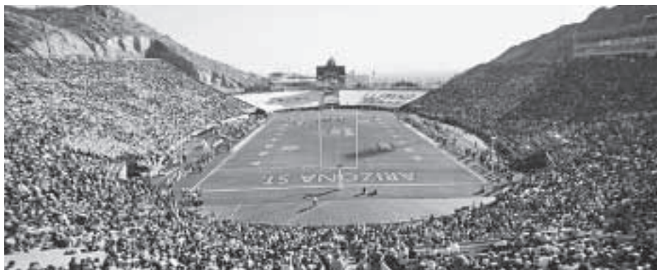
ASU defeated Purdue in the 2004 Vitalis Sun Bowl, which marked the Sun Devils' sixth bowl appearance in nine years and its first win since 1997.