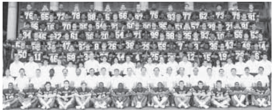
1987 Arizona State Rose Bowl Team